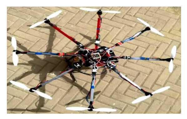
Fig. 8. Octocopter fabricated structure.